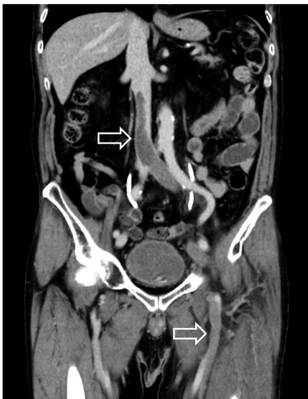
Figure 1. Abdominal computed tomography scan on admission showing a massive thrombus in the inferior vena cava and iliofemoral vein (arrow).

We reported a case of a 70-year-old man with a massive DVT extending from the lower extremity to the IVC, which was effectively treated with CDT and a factor Xa inhibitor.