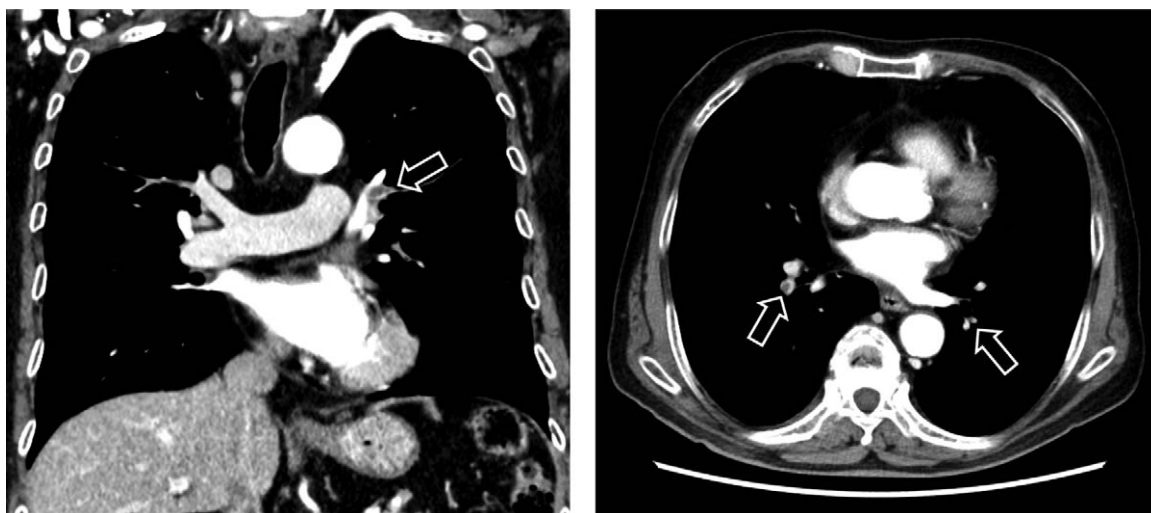
Figure 2. Chest computed tomography scan on admission showing a contrast deficit in the bilateral pulmonary artery (arrow).

Medical management is generally the first line of treatment for a PE and DVT. We selected fondaparinux for anticoagulation at first, because we have previous experience of its use as a VTE treatment. Furthermore, since the hemodynamics of this patient were preserved and he has been under steroid treatment, we did not perform CDT first due to the risk of bleeding and infection. Although the effectiveness of once-daily subcutaneous fondaparinux on DVT patients has been reported previously, [4] it could not reduce thrombosis 1 week after hospitalization in this case. Because massive DVT may cause PTS and this patient had no contraindications for thrombolysis such as bleeding diathesis, malignancy, and renal failure, we changed anticoagulation as a monotherapy to CDT. The CaVenT study of patients with iliofemoral DVT demonstrated that the addition of CDT to anticoagulant therapy significantly improved iliofemoral patency as well as reducing the frequency of PTS compared to standard therapy alone. [5] The guidelines from the American College of Chest Physicians recommend that CDT should be used in patients