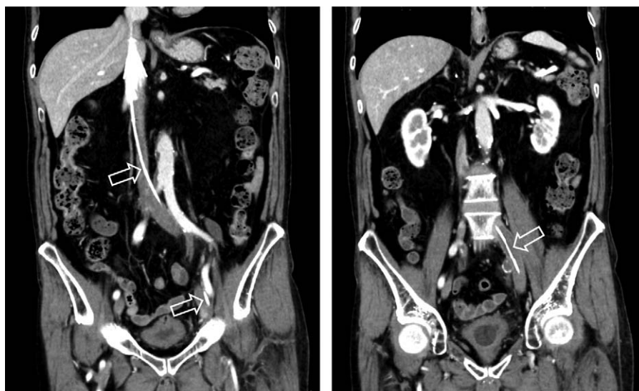
Figure 3. Abdominal computed tomography scan showing catheter-directed thrombolysis treatment using a Fountain infusion catheter (arrow).

with a life expectancy of more than a year, good functional status, extensive iliofemoral thrombosis, and who present soon after the onset of symptoms. [3] In contrast to systemic administration of the agent, CDT can increase infusion times leading to a high incidence of partial thrombolysis. By using a Fountain infusion catheter which has multiple side holes for dispersion of a thrombolytic agent, urokinase can be administrated directly into the thrombus. The conceivable advantages of intrathrombus infusion are as follows: clot removal efficacy is enhanced by the ability to achieve an increased intrathrombus drug concentration, and the additional mechanical thrombus disruption by directly spraying the thrombolytic drug may further enhance pharmacological dissolution of the thrombus. [6] In fact, because CDT preceded the medication treatment, edoxaban dramatically reduced the thrombus except for the part in the iliac vein in this case. The duration of future treatment with edoxaban has been a matter of debate. We consider that edoxaban therapy should be continued as long as possible, because recurrence of an